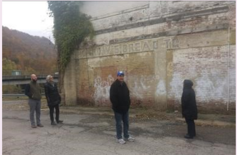
Hoping this building is added to the National Register to become a tourism office and restaurant in Pineville with the use of historic tax credits!