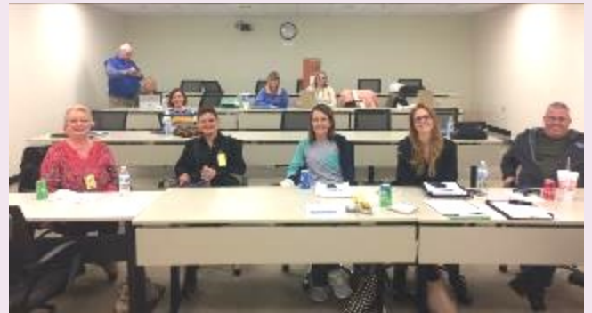
We had a great 40th Anniversary meeting! Lots to plan and do and they'll be calling on you!!!